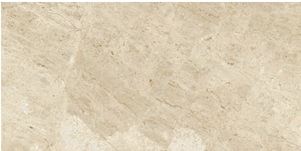
89204 12x24 Matte Eggshell