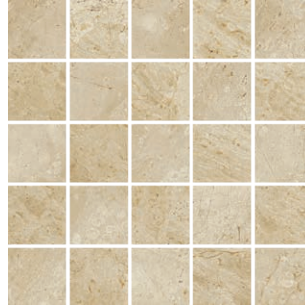
89233/M12 Matte Wicker 25pc Mosaic