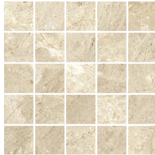
89204/M12 Matte Eggshell 25pc Mosaic