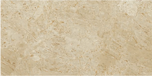
89233 12x24 Matte Wicker