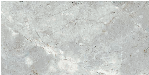
89214 12x24 Matte MattePumice