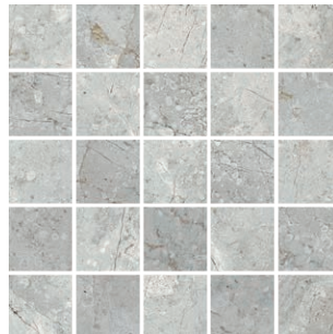
89214/M12 Matte Pumice 25pc Mosaic